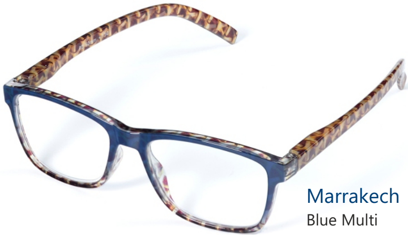
Marrakech Blue Multi