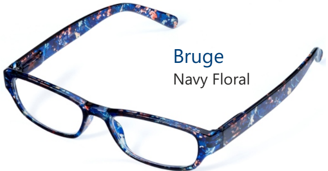
Bruge Navy Floral