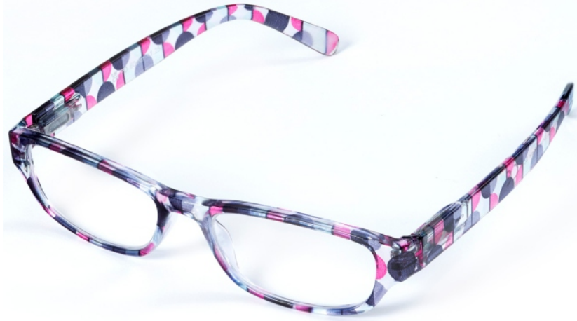
Bruge Pink Spot